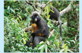
Spot the cute Dusky Leaf Monkey with its trademark "spectacles"

Escape the hustle and bustle of the city and rejuvenate in the cool temperature ranging from 18°C to 26°C. The serenity at the peak will melt away your stress, keeping you calm and relaxed as you breathe in the pristine oxygen-rich air.