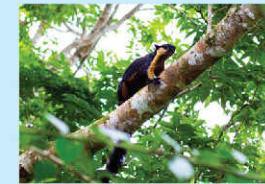
The Giant Black Squirrel is one of the largest squirrels in the world.

Marvel at the heritage ambience of picturesque antiquated pre-war colonial-style bungalows and buildings nestled among embracing trees. Feel the surreal charms and sensation of the European countryside in the lush rainforest like no other.