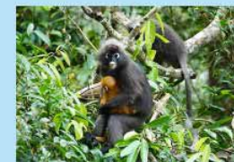
Spot the cute Dusky Leaf Monkey with its trademark "spectacles"

Escape the hustle and bustle of the city and rejuvenate in the cool temperature ranging from 18°C to 26°C. The serenity at the peak will melt away your stress, keeping you calm and relaxed as you breathe in the pristine oxygen-rich air.