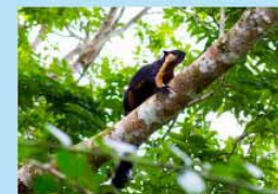
The Giant Black Squirrel is one of the largest squirrels in the world.

Marvel at the heritage ambience of picturesque antiquated pre-war colonial-style bungalows and buildings nestled among embracing trees. Feel the surreal charms and sensation of the European countryside in the lush rainforest like no other.