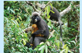
Spot the cute Dusky Leaf Monkey with its trademark "spectacles"

Escape the hustle and bustle of the city and rejuvenate in the cool temperature ranging from 18°C to 26°C. The serenity at the peak will melt away your stress, keeping you calm and relaxed as you breathe in the pristine oxygen-rich air.