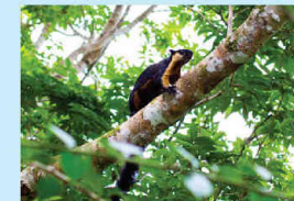
The Giant Black Squirrel is one of the largest squirrels in the world.

Marvel at the heritage ambience of picturesque antiquated pre-war colonial-style bungalows and buildings nestled among embracing trees. Feel the surreal charms and sensation of the European countryside in the lush rainforest like no other.